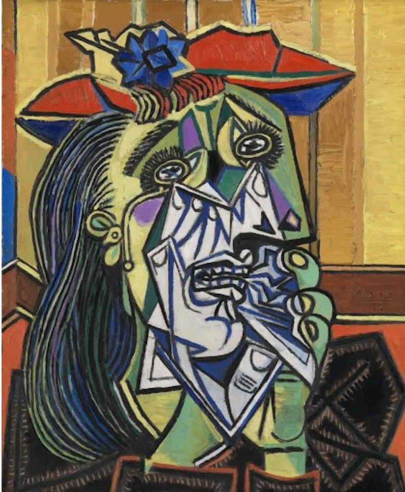
The Weeping Woman, Pablo Picasso, 1937