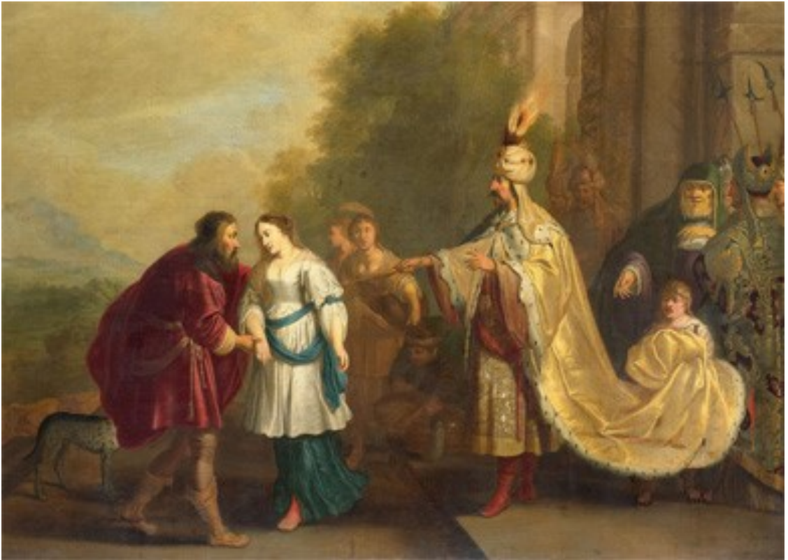
Pharaoh Returns Sarah to Abraham, Isaac Isaacsz, 1640