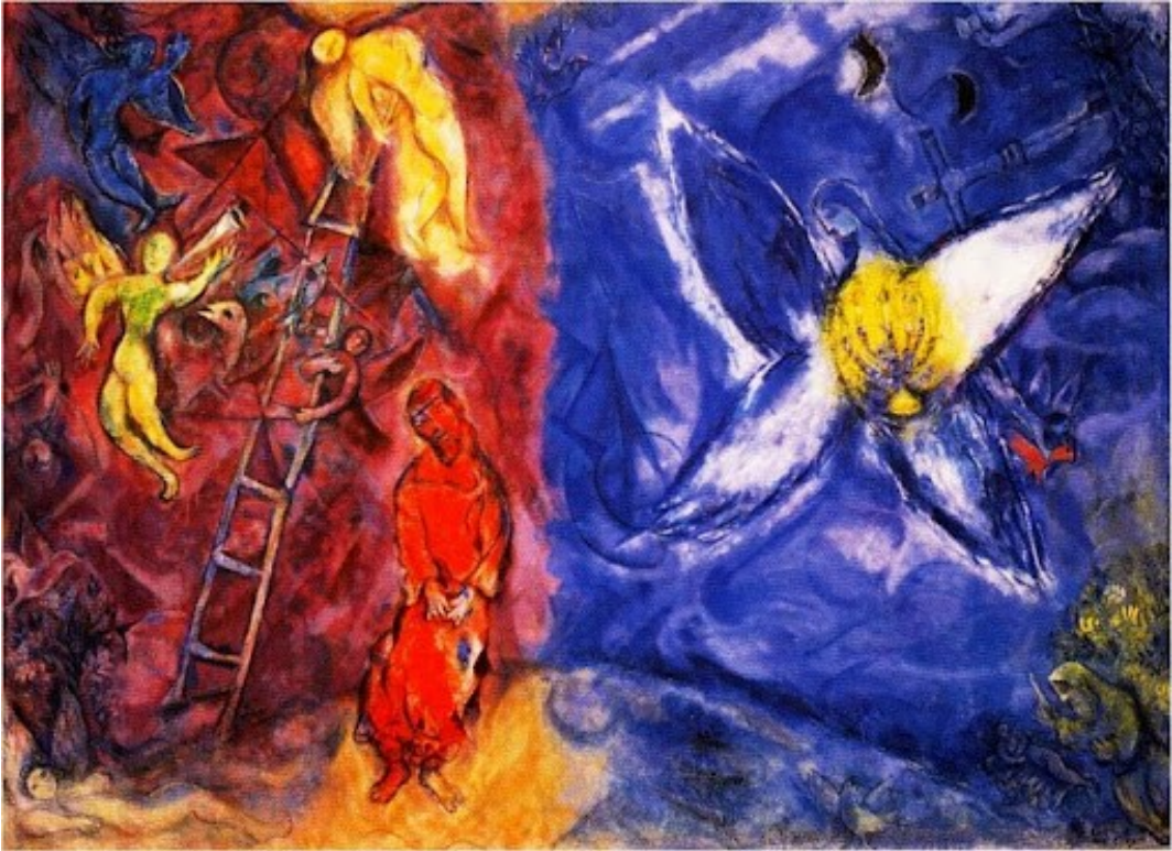
Jacob's Dream, Marc Chagall, 1966