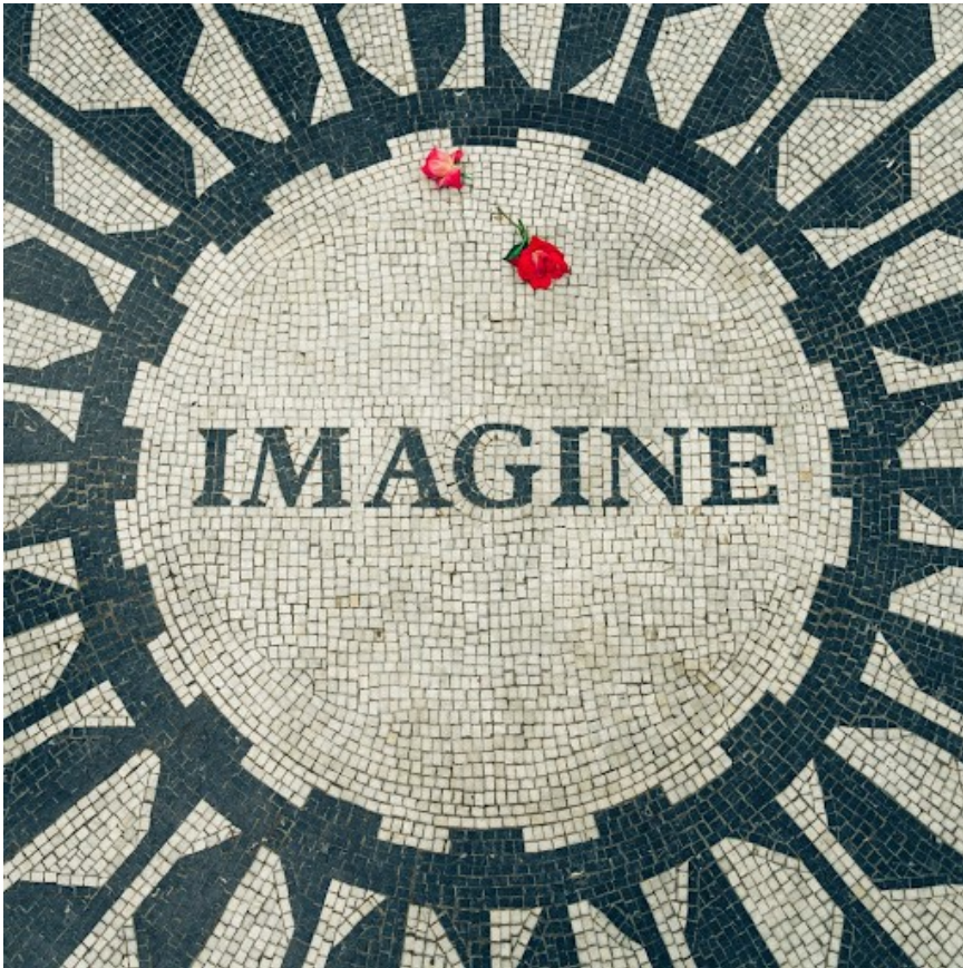
Black and white mosaic dedicated to John Lennon in Central Park