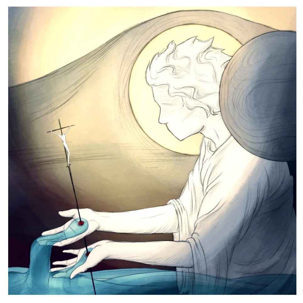
Pour Yourself Out, The "Full Eyes" Collective, 2015