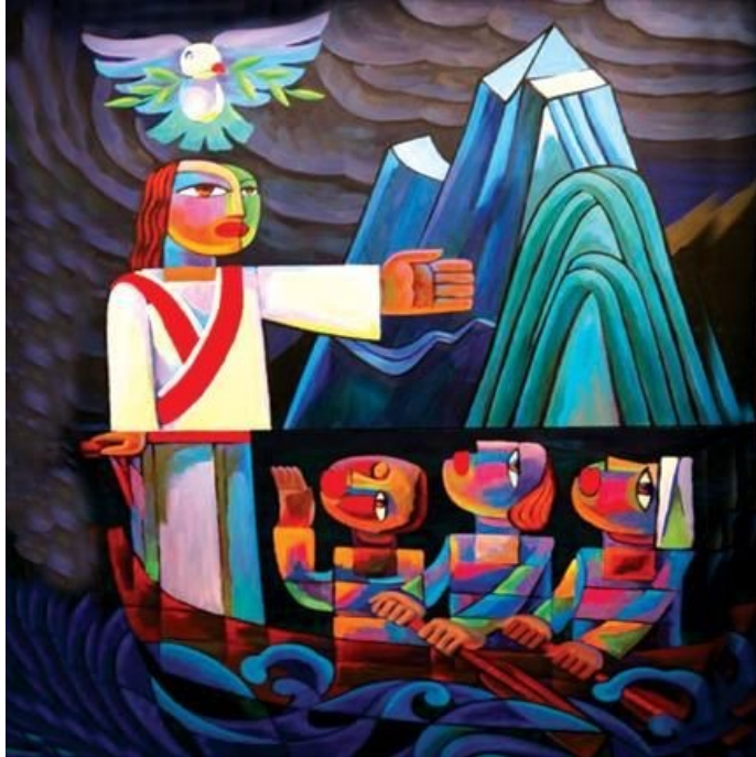
Going to The Mount of Transfiguration, He Qi, 2004

“Transfiguration” refers to a change in form or appearance. At the Transfiguration of the Lord, we celebrate the revelation of divine glory in the human life of Jesus Christ. Jesus’ radiant appearance on the mountaintop evokes the consuming fire of the glory of the Lord at Mount Sinai. Standing with Moses and Elijah, Jesus represents the fulfillment of the law and the prophets. The transfiguration looks back to Jesus’ incarnation and baptism, as God again claims him as a beloved child. This event also looks forward to his death and resurrection, as the one who is lifted up on the cross will reveal the glorious victory of God.