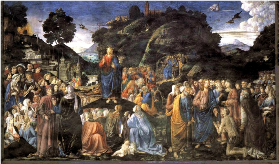
"Sermon on the Plain," Cosimo Rosselli, Florence, 1439-1507

How the Bible became the Bible is one of the most fascinating mysteries of all. For example, today we are going to hear words from what scholars call Jesus' Sermon on The Plain from the gospel of Luke. Listening carefully, we'll hear that these words sound very similar to things Jesus says in the gospel of Matthew – during a time scholars call Jesus' Sermon on The Mount . The two narratives have distinct differences; did Jesus give two sermons? Were Matthew and Luke present for the event and then decide to record it differently? Is Matthew more 'accurate' than Luke, or vice versa?