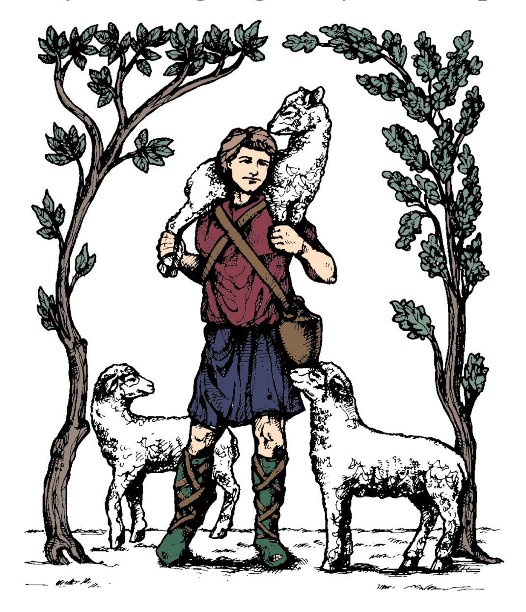
but now you have returned to the shepherd and guardian of your souls. 1 Peter 2:25, NRSV